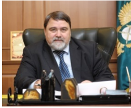
Igor Artemiev Head Federal Antimonopoly Service of the Russian Federation

25 years ago a truly a significant event took place in Russian economic policy - that year had become the starting point of the anti-monopoly regulation in Russia. At the end of the 80's – beginning of 90's the implementation of new economic reforms in the Russian Federation has necessitated a completely new legal framework. It was then that the first steps of development of competition within a market economy were taken.