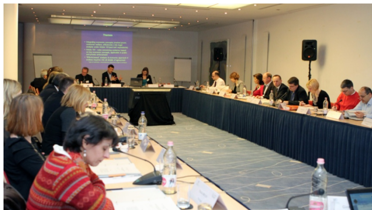
Seminar on European Competition Law for National Judges 22-23 February 2013