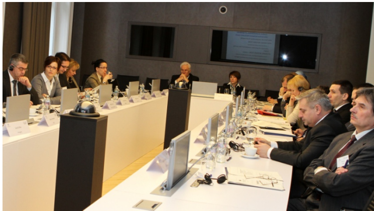
Heads of Authorities' Meeting 21 January 2013